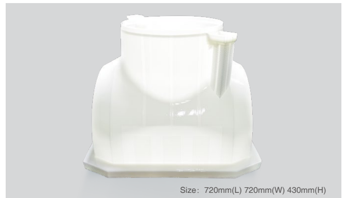
Size: 720mm(L) 720mm(W) 430mm(H)